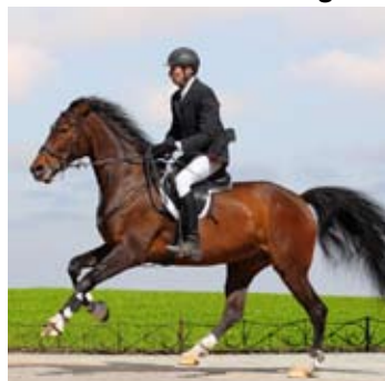
c. horseback riding