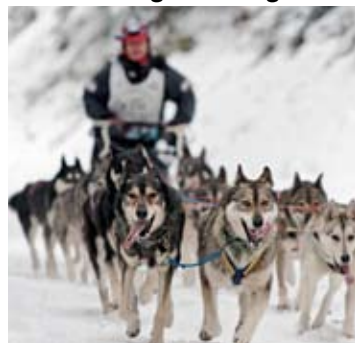
b. dog sledding