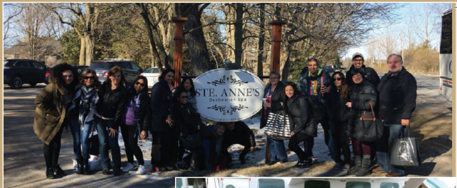
▲ PA Spa Day at St. Anne's