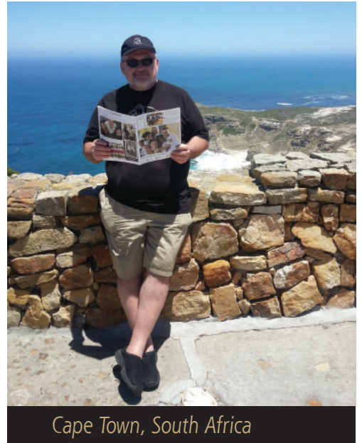
Cape Town, South Africa