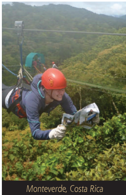
Monteverde, Costa Rica