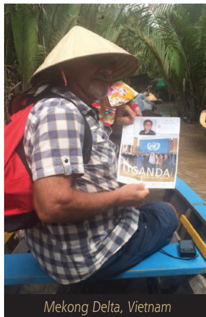
Mekong Delta, Vietnam