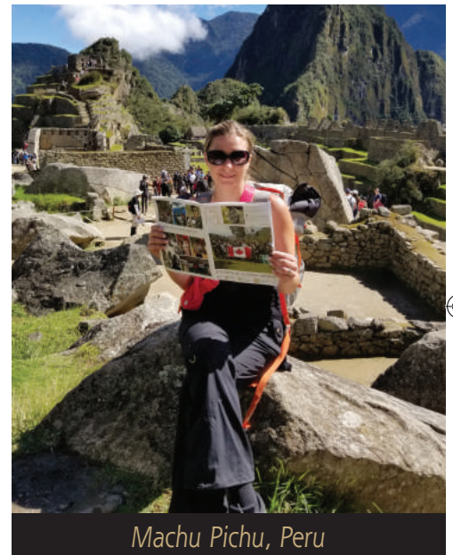
Machu Pichu, Peru