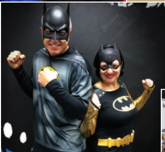
◀ PA Halloween