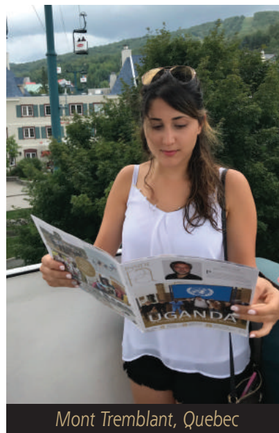
Mont Tremblant, Quebec