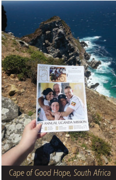
Cape of Good Hope, South Africa