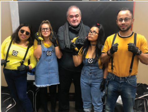
▲ PA Halloween