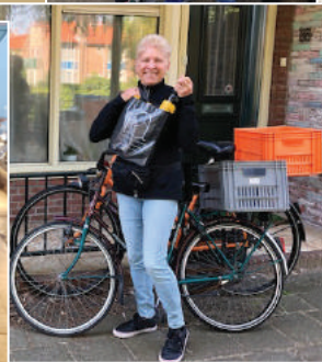
▲ PA Bag in Italy