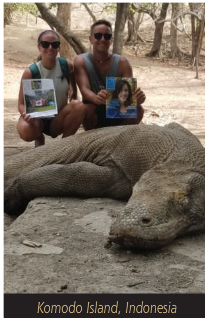
Komodo Island, Indonesia