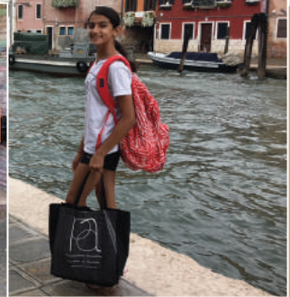
▲ PA Bag in Venice