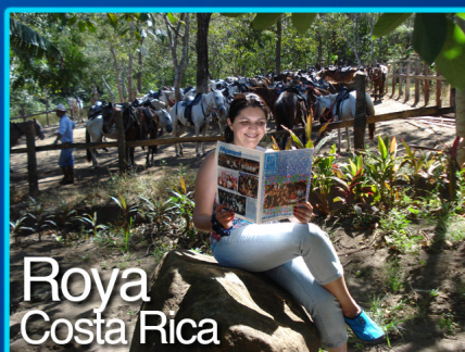
Roya Costa Rica