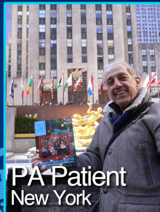
PA Patient New York