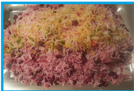
Albaloo Polo (Cherry Rice)