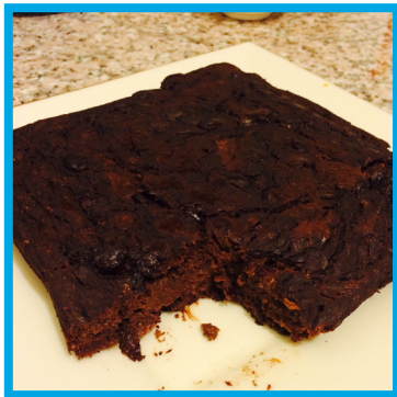
Paleo Zucchini Brownies

Can You Guess Who Cooked These Delicious Dishes?