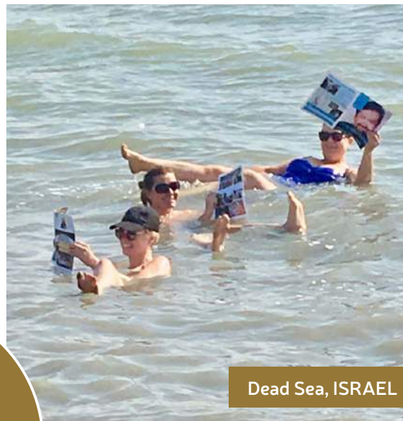
Dead Sea, ISRAEL