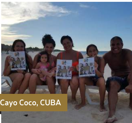
Cayo Coco, CUBA