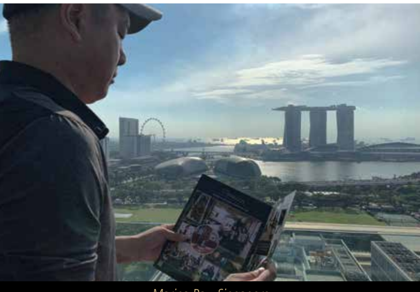
Marina Bay, Singapore